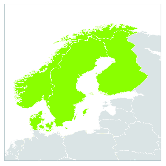
~100 % detailed street network